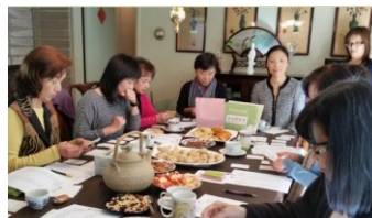
Heart to Heart® Café

Volunteer board is comprised of health and medical professionals, community leaders, and individuals with a passion for advance care planning and end-of-life care issues.