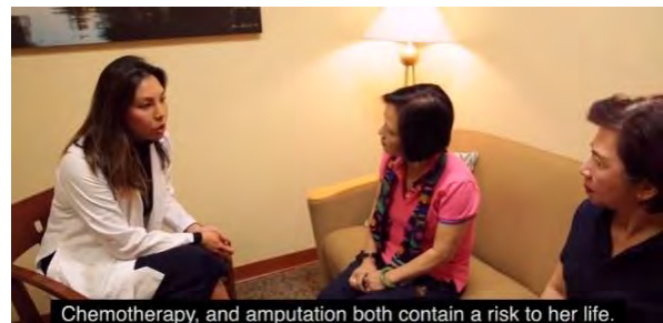
Chemotherapy, and amputation both contain a risk to her life.

and Advance Health Care Directive. City of Hope has a long-standing reputation for excellence and compassionate care that matches the mission of the Chinese American Coalition for Compassionate Care. Together, we are committed to help ease the suffering of cancer patients, survivors, caregivers, and families through community service, health education, and coalition building.