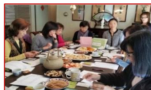
Heart to Heart® Café

Board of Directors: 9-15-member volunteer board is comprised of health and medical professionals, community leaders, family caregivers, and individuals dedicated to the mission.